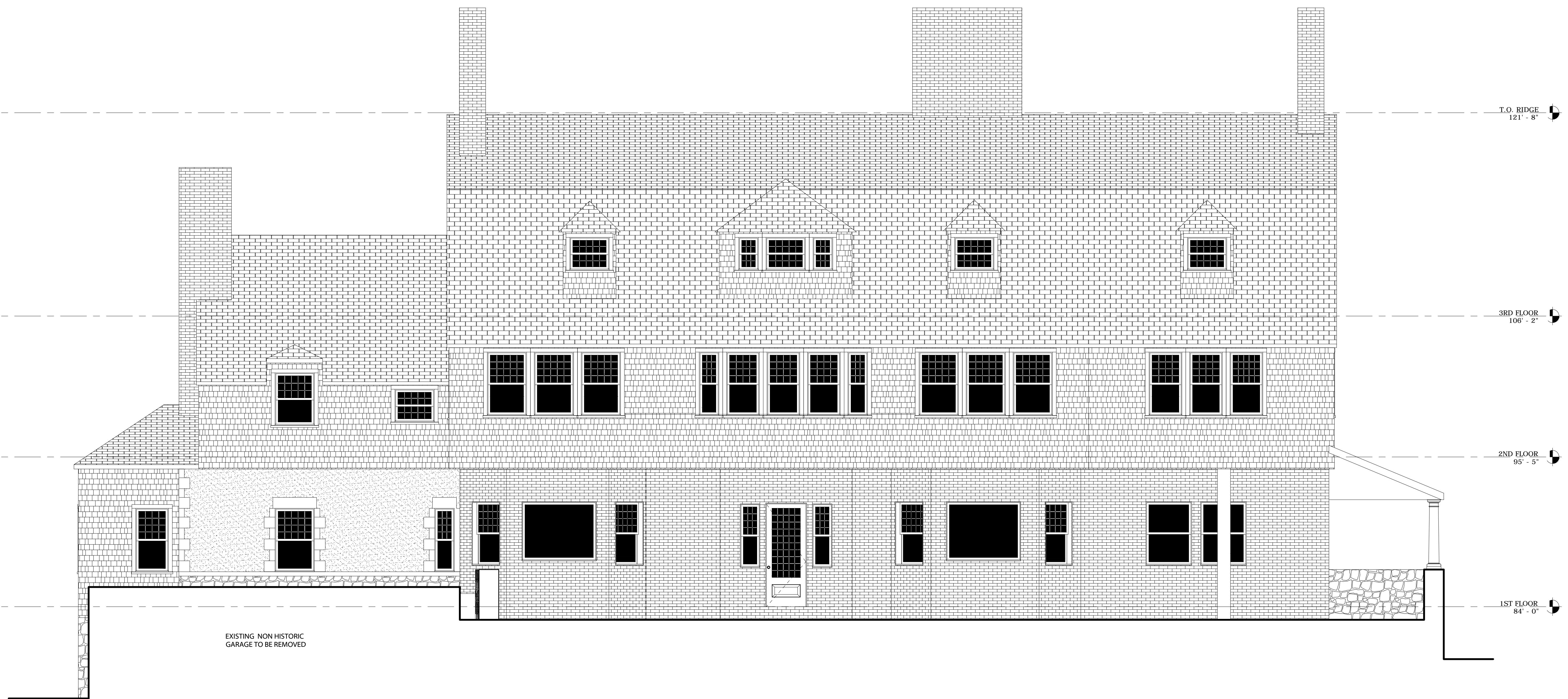
1 EXISTING SOUTH ELEVATION SCALE: 1/4" = 1'-0"